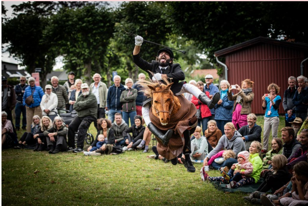
Les Goulus (FR) performing THE HORSEMEN at Jarlens Grund in Espergærde

Spreading out the programme also drew people to places they had never visited and created new meetings and common experiences – the basis for stronger local communities at the Northwest part of Helsingør, Børnenes Hus, Kvistgård Haveforening, Jarlens Grund, at nursing homes and more. In Helsingør, for example, the social outreach project 'Gang i Nordvest' initiated workshops with many participants before and after performances.