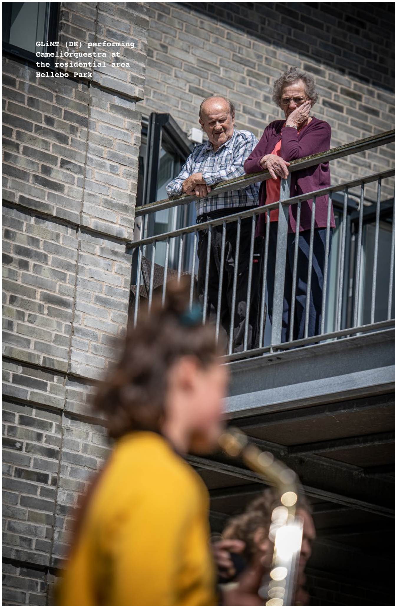
GLiMT (DK) performing CameliOrchestra at the residential area Hellebo Park